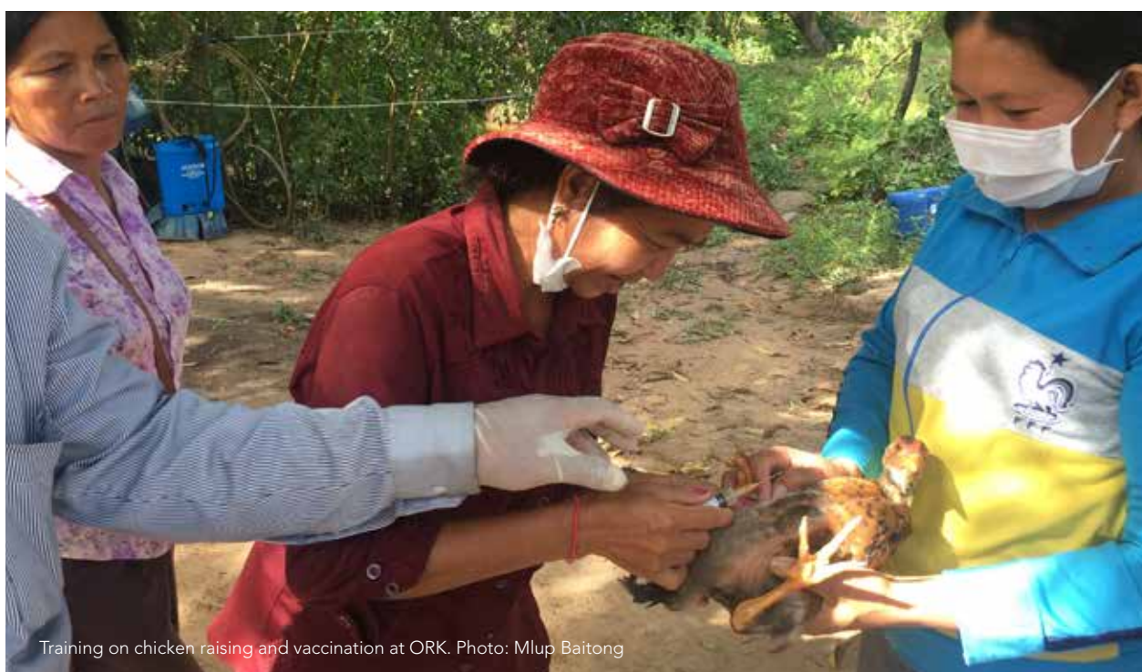
Training on chicken raising and vaccination at ORK.

“ The targeted farmers have improved their capacity in terms of improving their livelihood