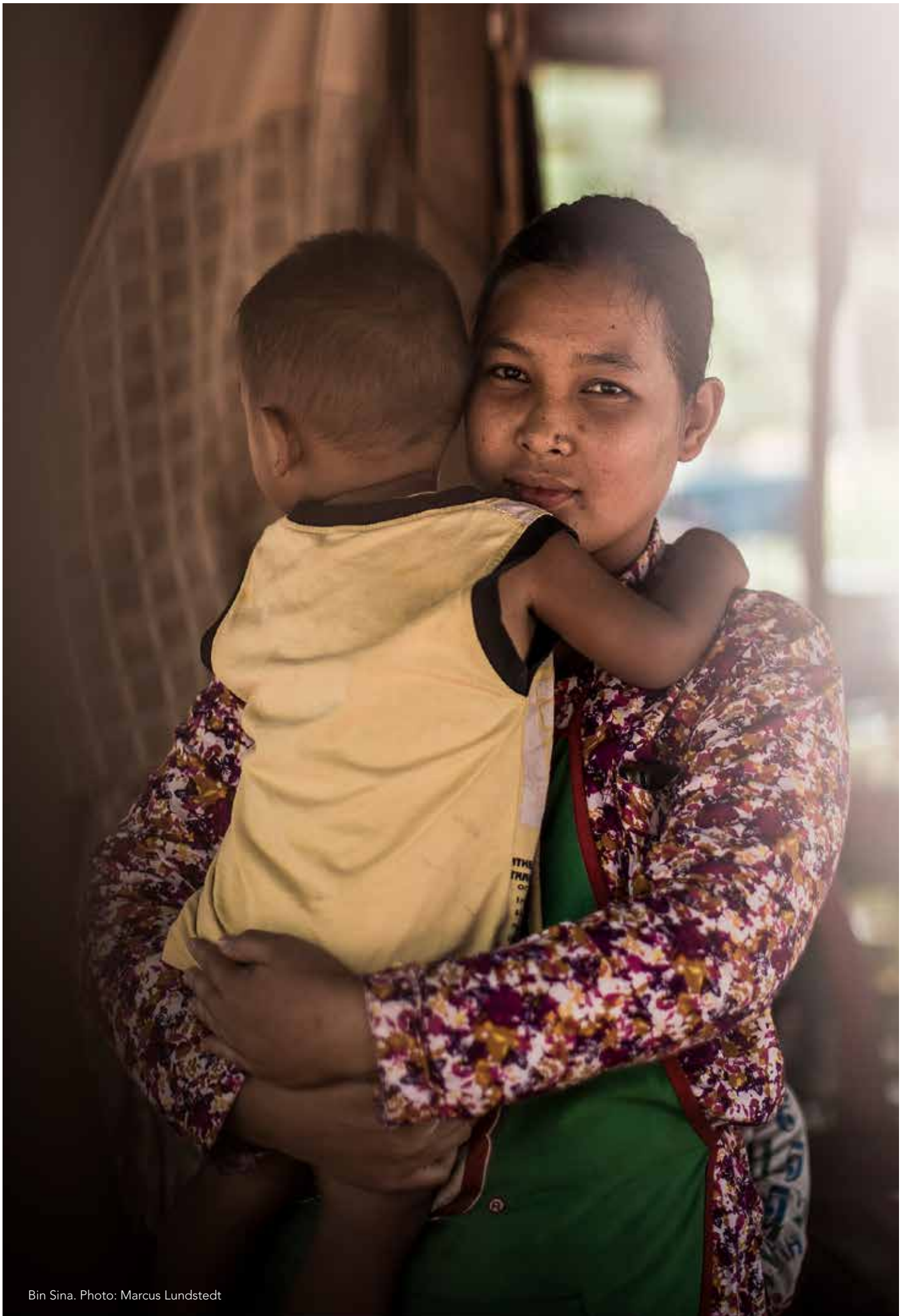
Bin Sina.