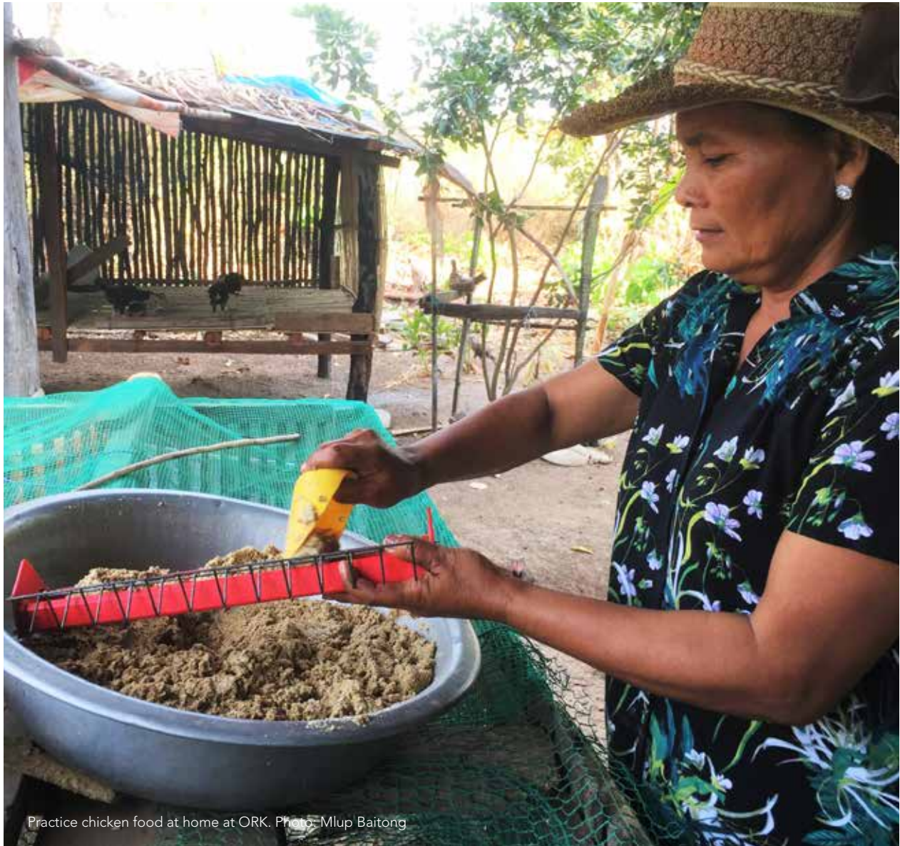
Practice chicken food at home at ORK.