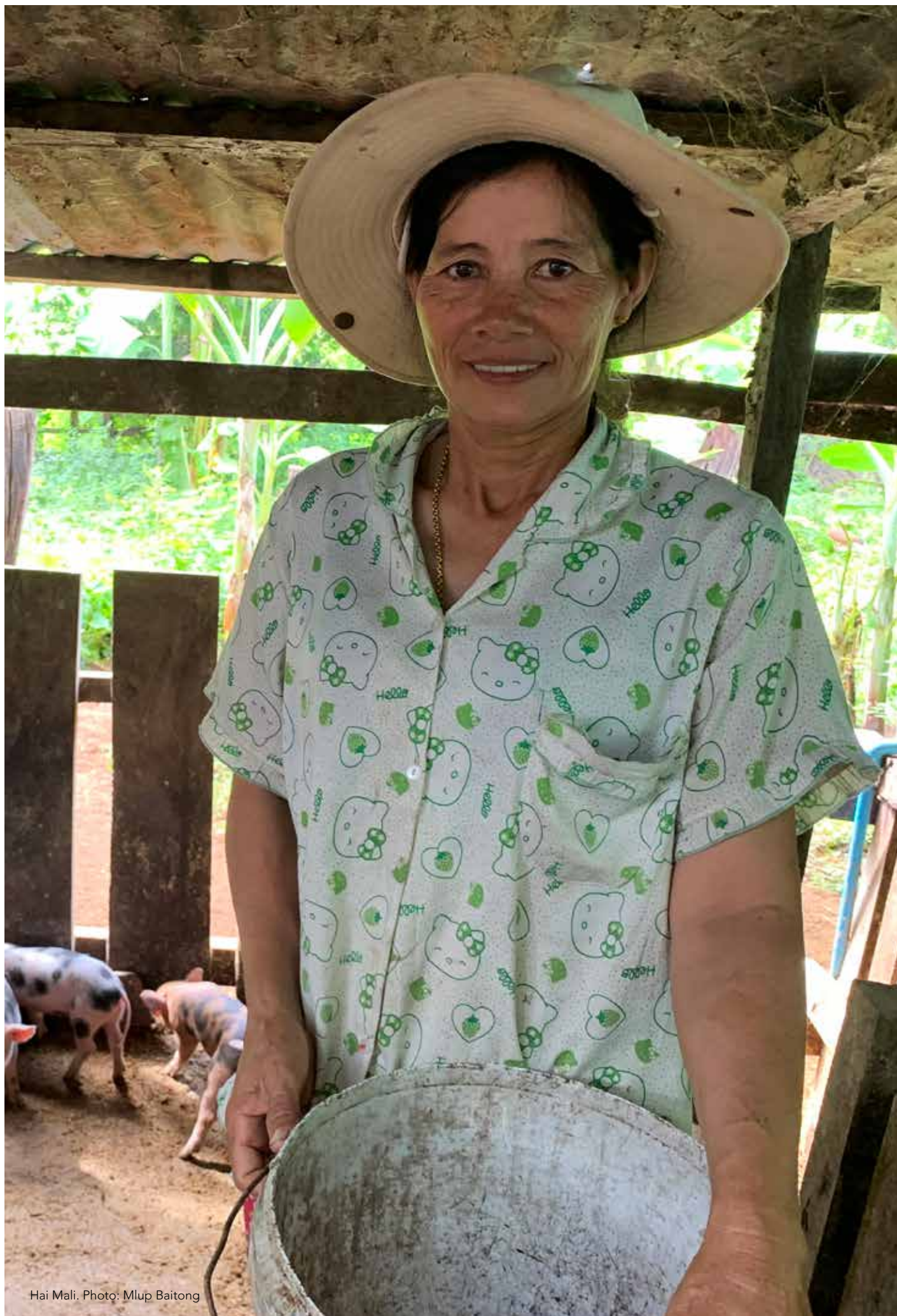
Hai Mali.