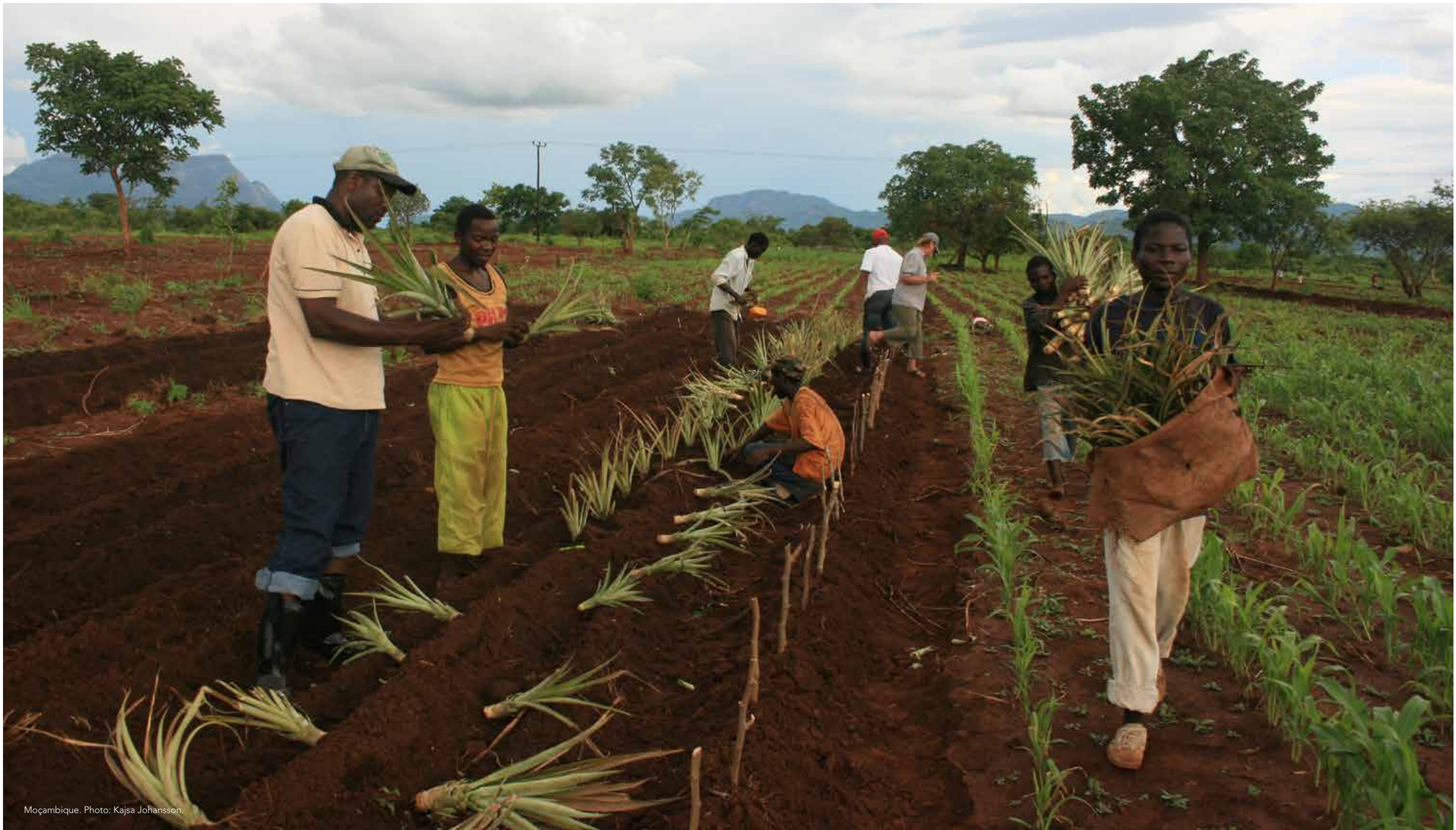
Moçambique.